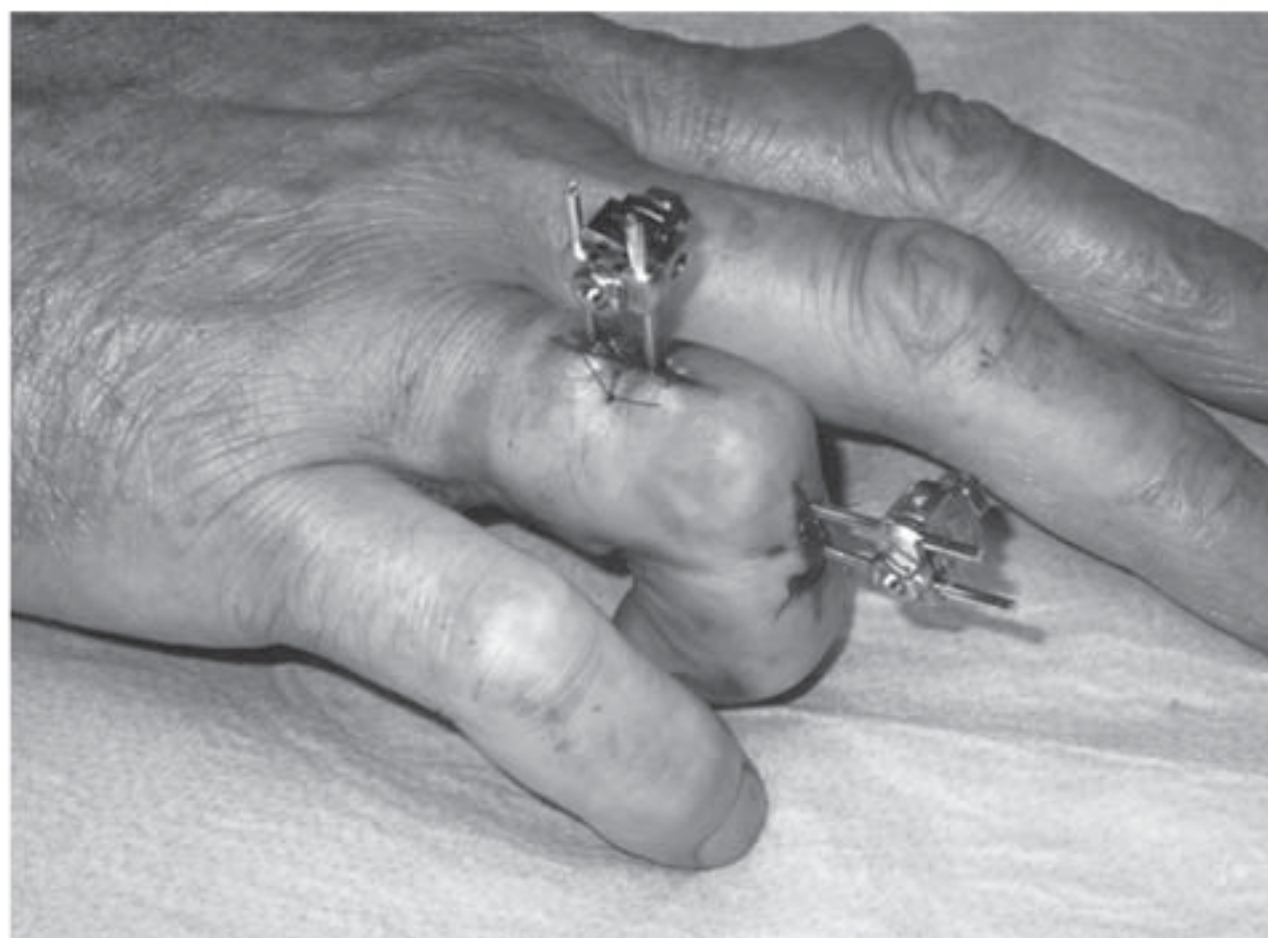
Figure 1. Insertion of the external fixator across the PIP joint.

exceeding 70° or recurrent PIPJ contracture that the surgeon predicts will be difficult to correct), for example, salvage procedures may have to be considered. These include dorsal wedge osteotomy of the proximal phalanx, arthrodesis of the PIPJ, or replacement arthroplasty (Moberg, 1973). Rarely, amputation may have to be considered for the severe or recurrent PIPJ contracture.