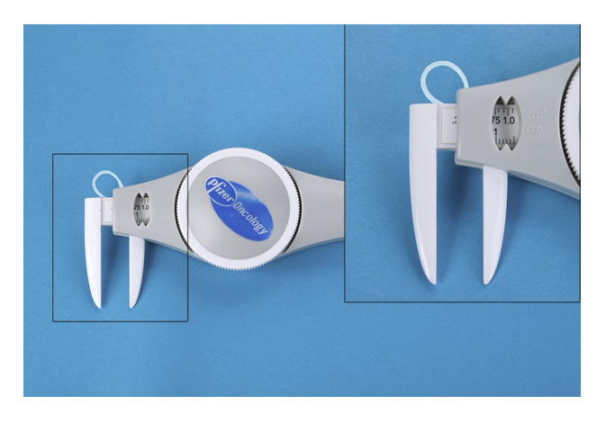
FIGURE 1: Tumorimeter with loop and caliper that was used in this study.

The study was approved by the institutional review board and informed consent was obtained from each participant. Patients with primary DD in at least one hand, who participated in previous studies of ours on