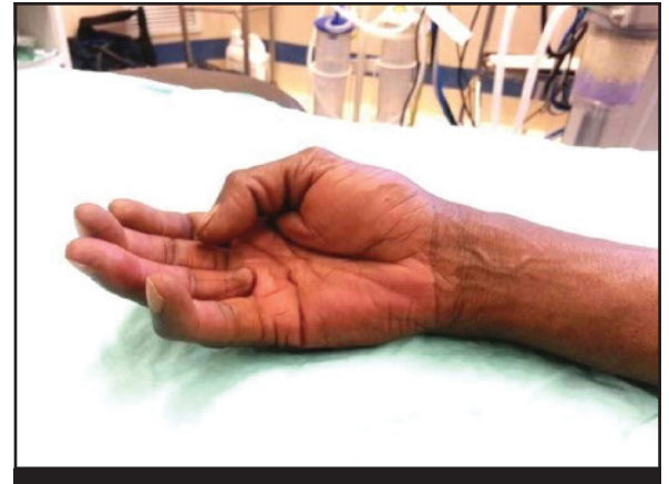
Figure 3. Right hand of the same patient as in Figure 2 during the second operation

In this period a total of 22 468 patients were operated for various conditions in our operating rooms. This would then mean that 0.2% of these patients were black patients who presented with Dupuytren's disease and underwent surgery. We also found that there has been an increasing number of African patients year on year since 1999 (Figure 1).