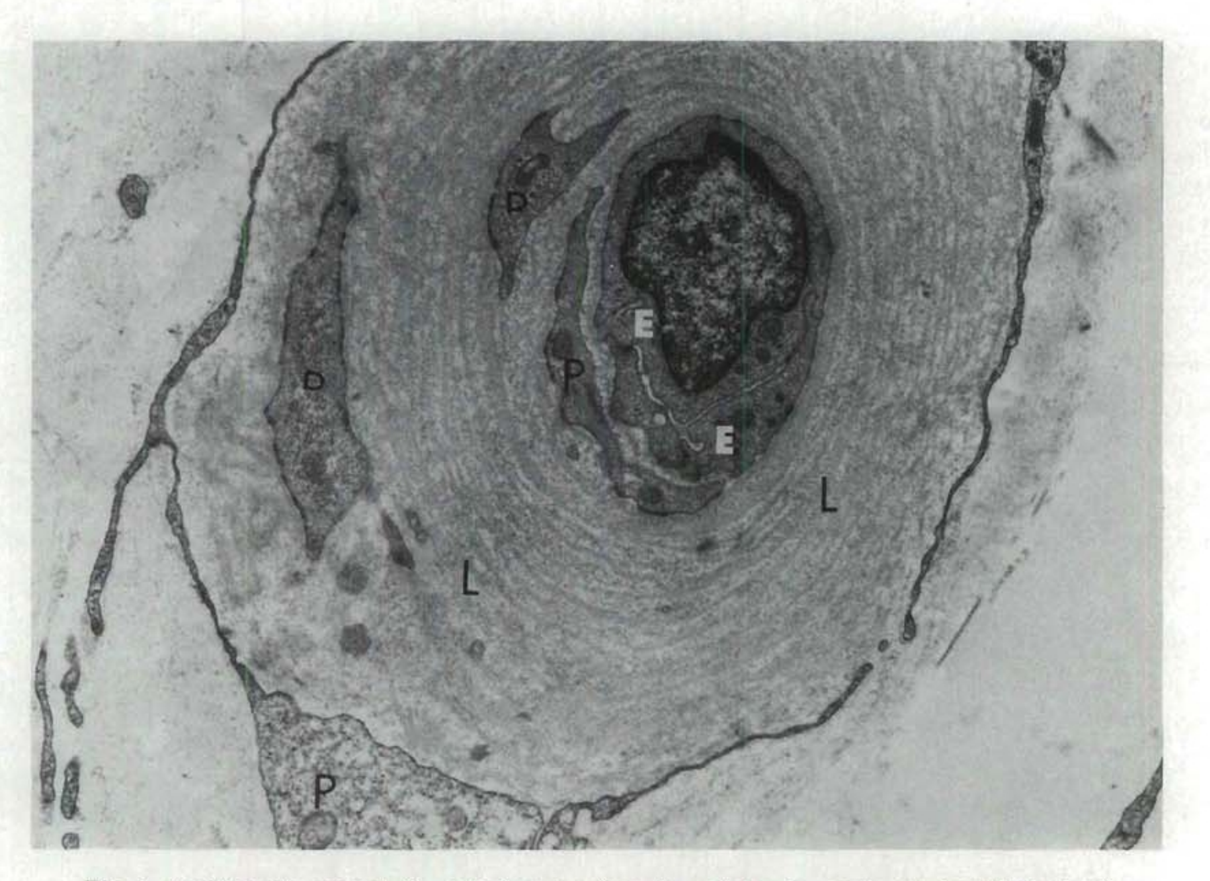
Fig. 1. A typical microvessel, 3 \mu m in diameter, from the peripheral vascular net about the body of the nodules. The lumen is occluded, and there are extreme layers of basal laminae (L), endothelial cells (E), and pericytes (P). (Magnification \times 12,000. )

Microvascular changes in Dupuytren's contracture 59