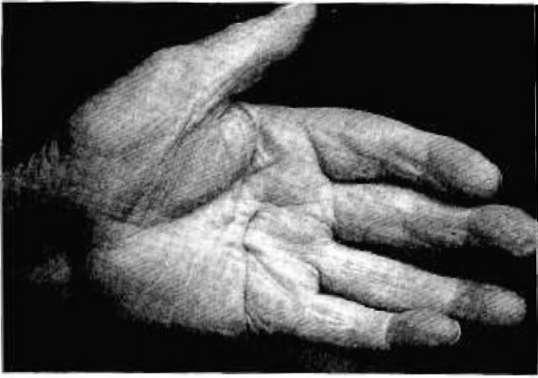
FIG. 3. The left hand showing mild ulnar deviation of the fingers. On examination, nodular thickening of the palmar fascia with two palpable palmar cords were observed.