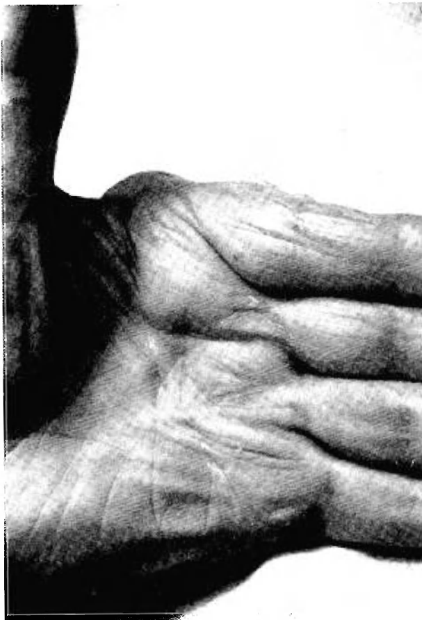
FIG. 4. Ulnar deviation of the fingers at the metacarpophalangeal joints is shown along with a palmar pretendinous cord involving the left ring finger.

vealed ulnar deviation deformity of the metacarpophalangeal joints of both hands. Limitation of passive extension was present especially in the left ring finger metacarpophalangeal joint. Careful examination of the palm revealed the presence of a pretendinous cord on the left side (Fig. 4) and a nodule in the palmar fascia of the right hand. Radiographic