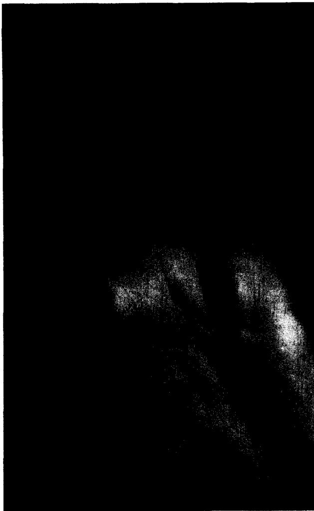
Fig. 3 Dupuytren's disease 89 months after a Colles' fracture.

seven patients with unilateral fractures, who at the time of the first review only had disease in the injured hand, had developed evidence of Dupuytren's disease in the other hand at the second review. All seven had first noticed the development of disease in the contra-lateral hand between 12 and 89 months (mean 52 months) after its appearance in the injured limb.