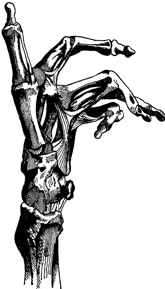
Fig. 1 Illustration of the dissection specimen presented to the Académie Royale de Médecine by Goyrand in 1833 (from Vogt, 1868).

In 1833, Goyrand presented his first paper on Dupuytren's disease to the Académie Royale de Médecine. He described and illustrated the cadaveric findings in both hands of a man who had suffered from Dupuytren's disease (Fig. 1). This paper is recognized as one of the most significant early works on the management of Dupuytren's disease. It includes a description of his variation of the palmar fasciotomy operation, already