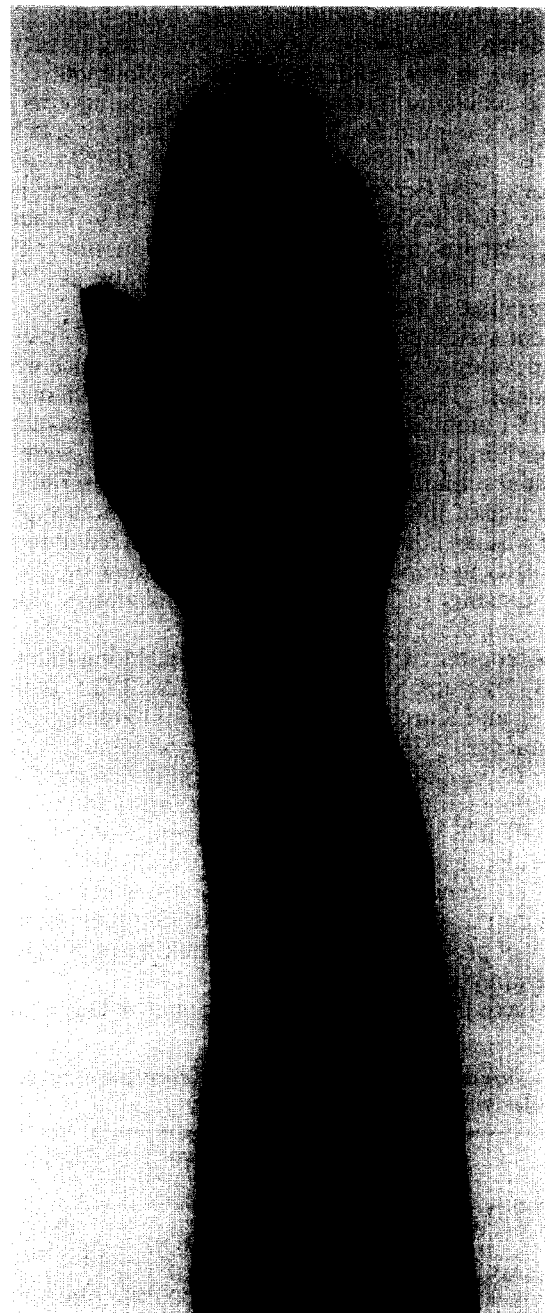
Fig. 4 Dupuytren's disease (palmar band indicated by arrows) four years after harvesting of a radial forearm osteocutaneous free flap.

Piggot, of a squamous cell carcinoma from the floor of the mouth. The specimen included the central portion of the mandible. The intra-oral defect was reconstructed with a free vascularized radial forearm flap, which included a partial-thickness section of the radius to reconstitute the excised mandible. Six weeks after transfer of the flap, he was noticed to have developed a palmar cord in the line of the fourth ray (Fig. 4). This had not been present before the operation.