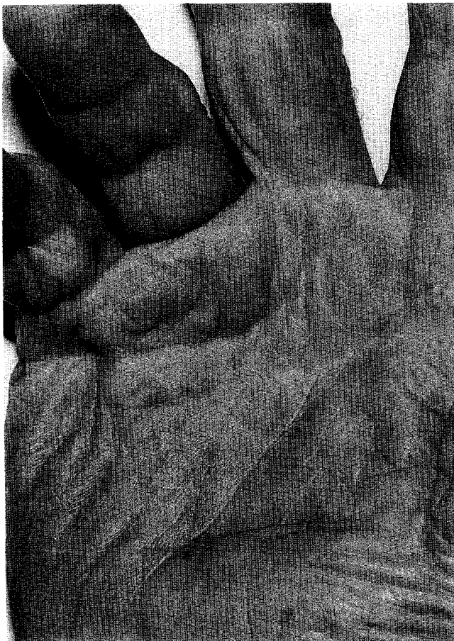
Fig 1 The hand of a man with Dupuytren's contracture. He has palmar skin tethering and a flexion contracture.

In Australia—60 years and over (Hueston, 1960): Males—22.8%; females—22.46%. In London—Average age 73 years (Smith, 1884). 10% with DC (males and females).