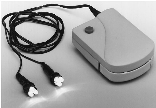
Figure 1. The Bionase unit, consisting of a control box containing the electronic circuit and a battery, and two light-emitting units for intranasal use. Note the push button on the control box.

emitting diode probes for intranasal use (Fig 1). A push-button switch on the control box activates the probes for 4.4 minutes, during which time 1 joule of light energy is delivered from each unit. Patients were instructed to introduce the probes into their nostrils as deeply as possible and to press the push button. Each nostril was subjected to low-energy stimulation (4 mW) for 4.4 minutes (1 joule per treatment session) three times a day for 14 consecutive days (Fig 1). Bionase devices with internally disconnected light emitting diodes probes were used for sham illumination in the placebo group.