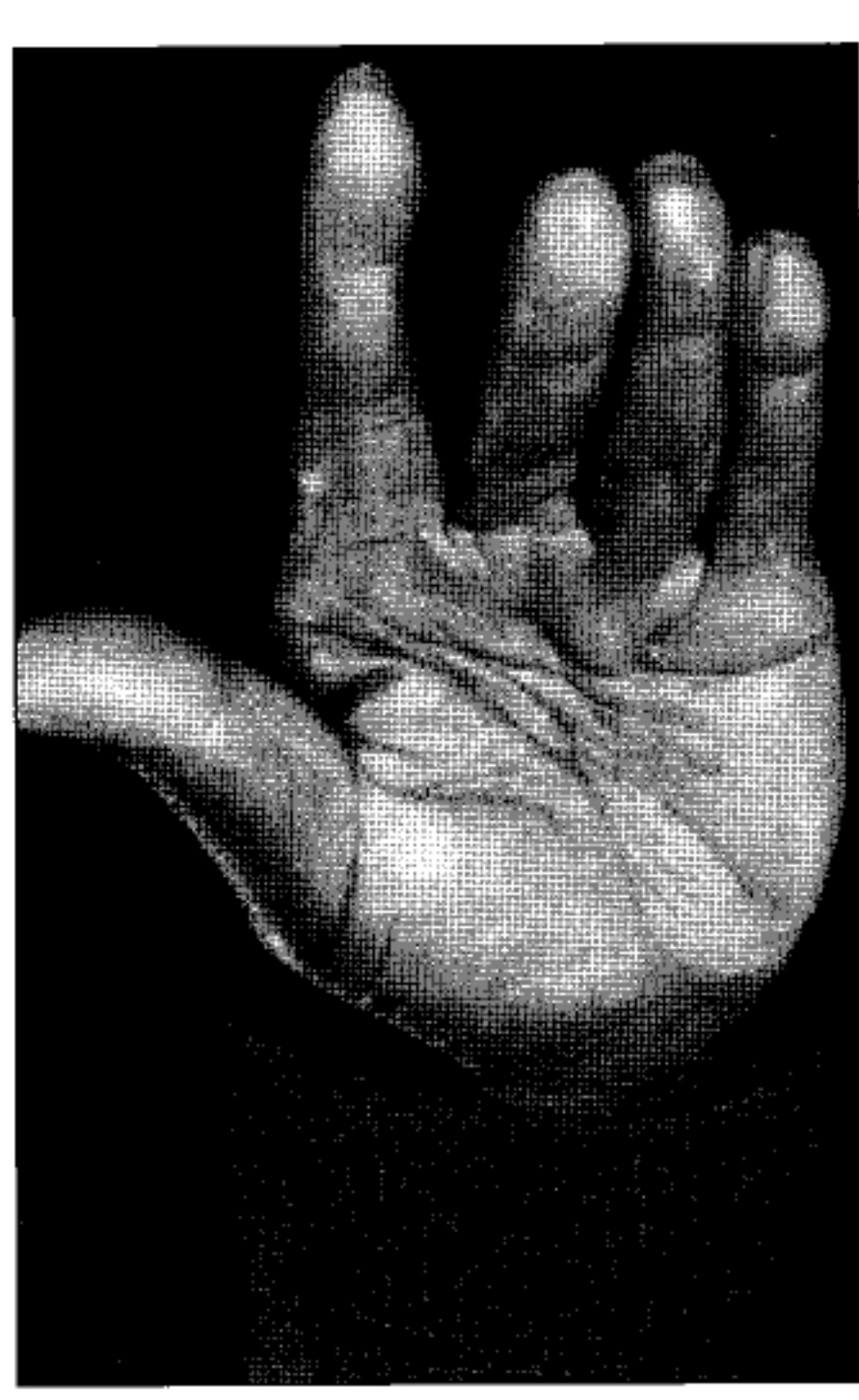
Figure 2. Palmar aspect of the patient's left hand while awaiting surgery for Dupuytren's contracture

history of diabetes or epilepsy. He has had no trauma to either hand.