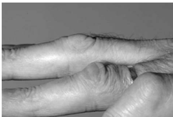
Figure 3 Knuckle pads. They may also occur along with plantar nodules as part of a Dupuytren's diathesis, where DD develops at a young age and to a severe degree, in those with a strong family history.

There is no relation between diabetic control and the severity of contractures, and DD has a generally milder form in diabetic patients. This suggests that diabetes may only be a triggering factor. It may be that microvascular changes in DM encourage local hypoxia, and this could elicit DD in those