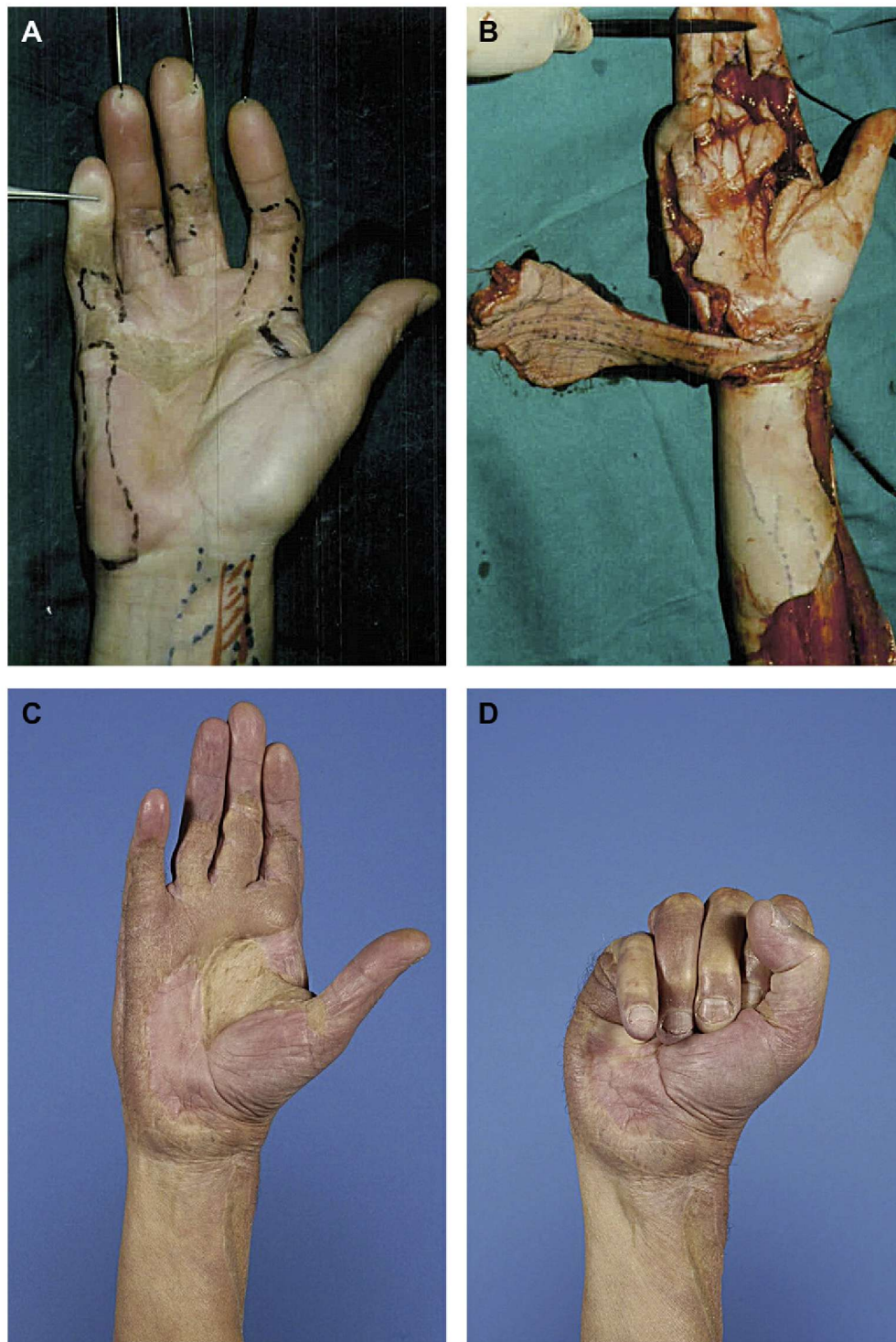
Figure 1 Surgical course of the first patient. This figure shows the preoperative (A) and peroperative (B) photograph of the right hand of our first patient. At that time he was 43 years old. Twenty years after surgery the patient is able to extend the fingers (C) and to make a fist (D).

In 1991 his right hand was also operated with a Rev. RFF. In 1988 and 1996 both feet were operated with a free vascularised upper lateral arm flap (ULAF) following excision of painful large nodules impeding normal gait (Figure 3). Additional surgeries over the years were for an arthrodesis of the PIP joint of the fifth finger due to a painful degenerative arthritis, to resolve the residual syndactylies of both hands