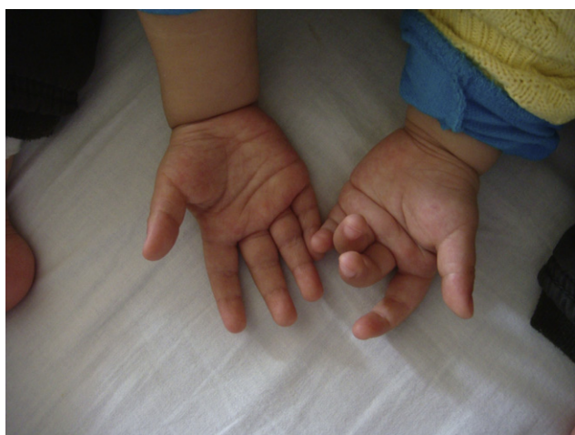
Figure 1 Preoperative manifestation. Flexion contracture of the left long and ring fingers. A deepening single transverse palmar crease was observed.

Dupuytren's disease in infants is exceedingly rare. Only six cases of histologically proven Dupuytren's disease have been reported worldwide in children under 10 years of age,