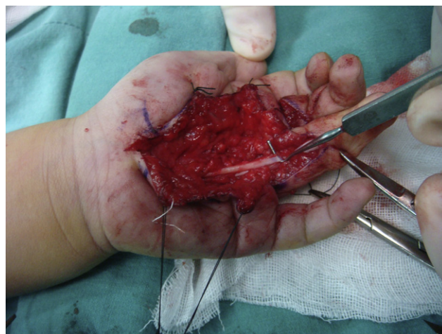
Figure 2 Intraoperative findings. The fibrotic mass and unusual tendinous band were excised.

including two infants aged 6 and 10 months. 3 The reasons for operating in our case were not only to correct the contracture deformity but also to exclude malignancy. Rhomberg et al. reported a 9-year-old boy who was diagnosed initially as Dupuytren's disease but finally was confirmed to be an epithelioid sarcoma. 4 Despite the infiltrative nature of the tissue plaque the pathologist was certain of the histological diagnosis of Dupuytren's. A diagnosis of Dupuytren's disease should not be made without histology.