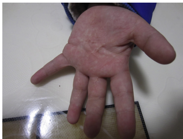
Figure 3 21 months' follow-up showed no functional disturbance.

The aetiology of Dupuytren's disease is multifactorial and the two infants' involvement suggests a genetic causation. Some of the common causes of childhood finger flexion contracture include camptodactyly, congenital ulnar drift, burns, extra-abdominal fibromatosis, infantile digital fibromatosis (recurring digital fibroma of childhood), epithelioid sarcoma, juvenile aponeurotic sarcoma, infantile fibrosarcoma, giant cell tumour of tendon sheath (localised nodular tenosynovitis), fibrous hamartoma of infancy and infantile myofibromatosis. 2,4,5 Infantile digital