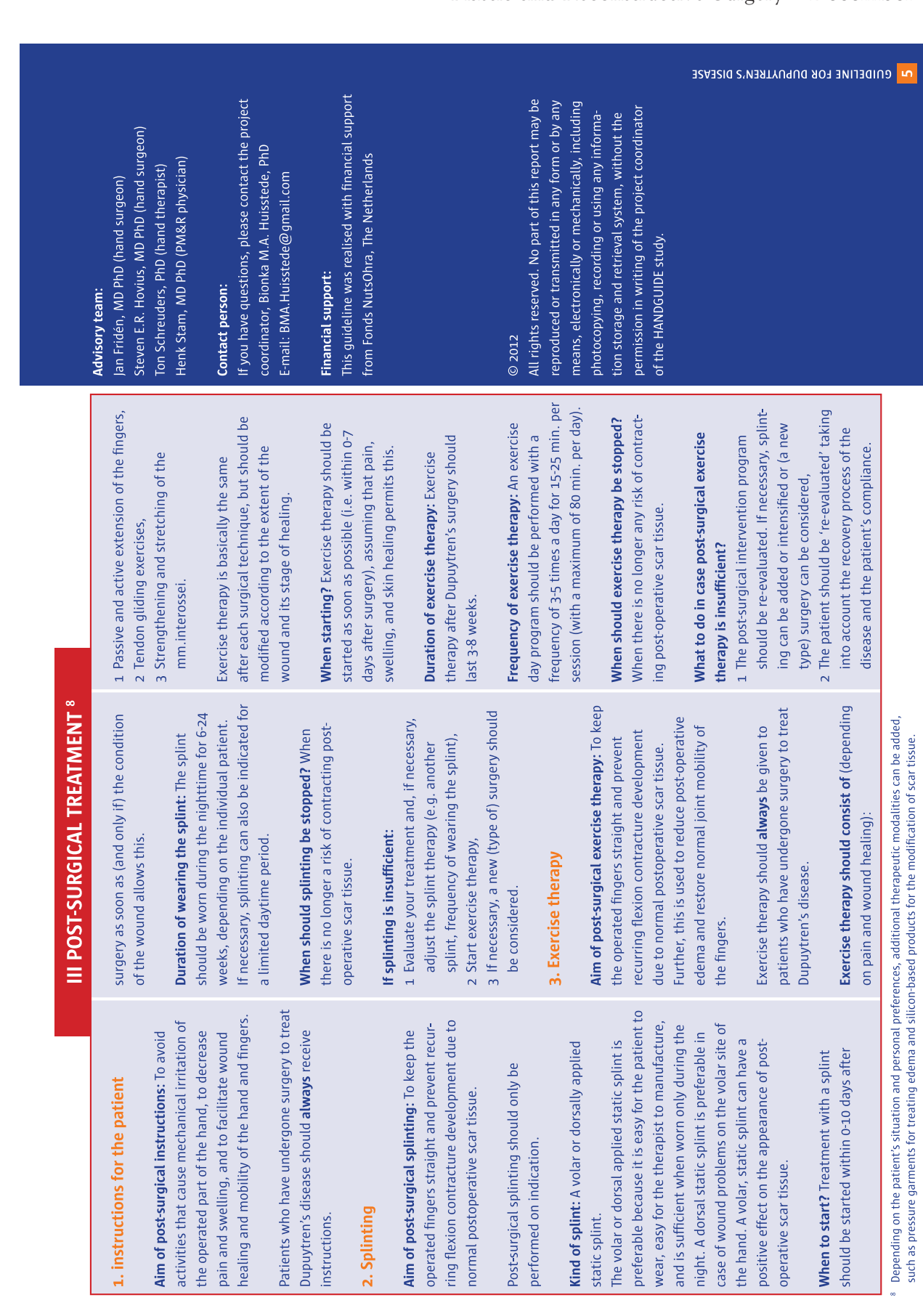
Fig. 1. Treatment guideline for Dupuytren disease.