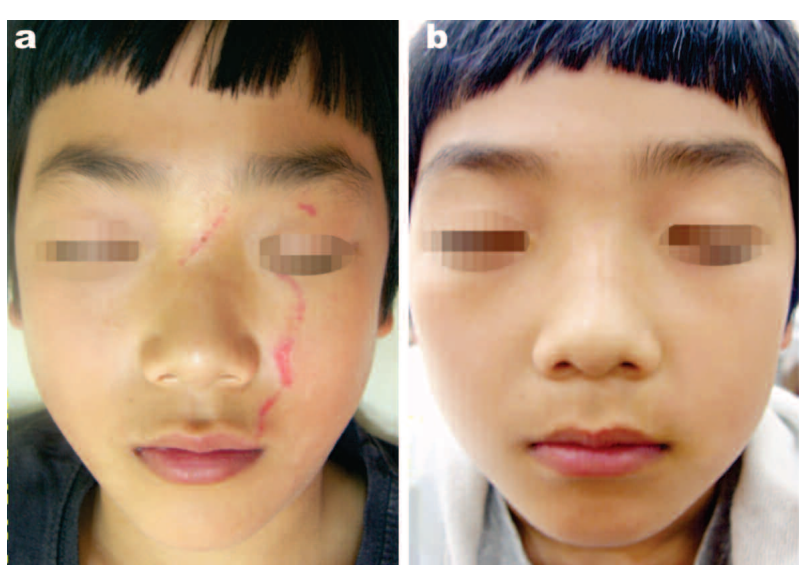
Fig. 2: A 7-year-old boy with 2 excoriation injuries to the left face (a) at baseline and (b) after 1 week of daily 830 nm LED treatments