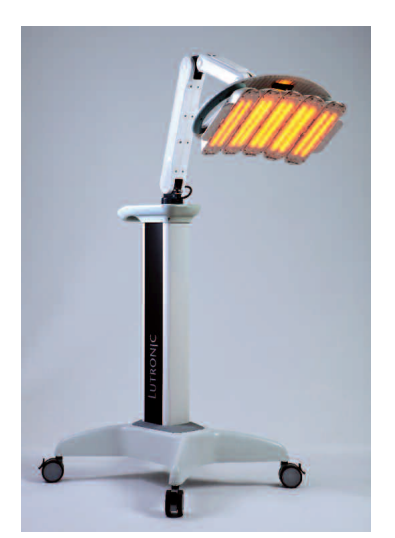
Fig. 1: The HEALITE II<sup>®</sup> LED phototherapy system (Lutronic Corp., Goyang, South Korea). The articulated planar arrays can be adjusted to fit the contour of any part of the body, and the 'place and stay' hinged arm allows adjustment for height and reach.