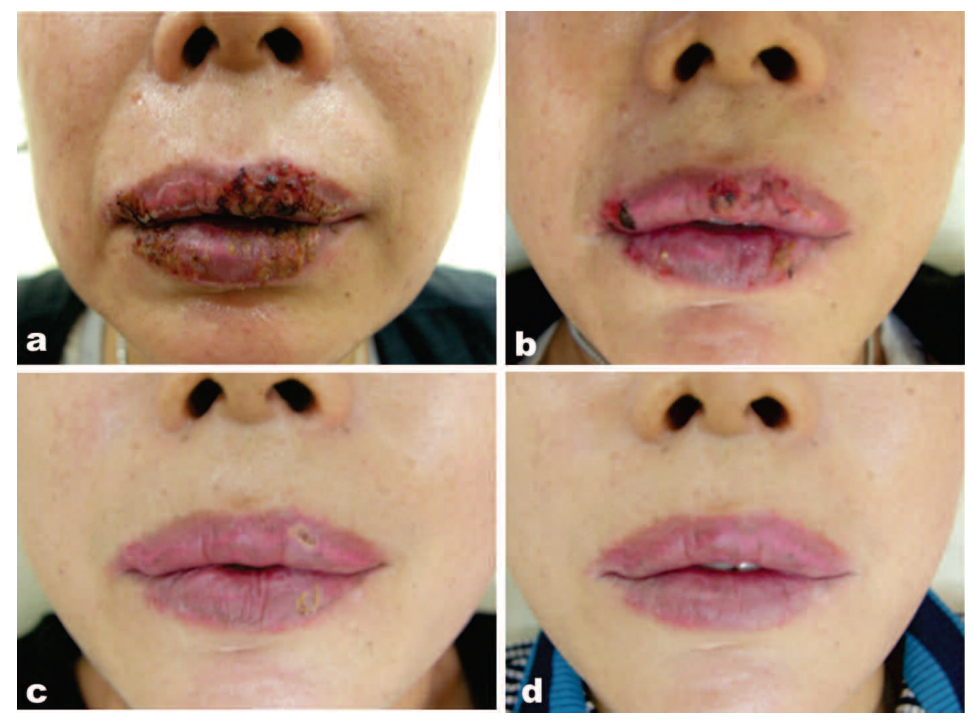
Fig. 6: An adverse reaction was seen in a 54-year-old female following an illegal cosmetic lip tattoo. (a) at baseline, swelling of the lips with secondary bacterial infection and herpes zoster can be seen. (b) Findings 1 week after start of treatment (4 sessions). (c) 2 weeks post-baseline, improvement is noted. (d) The final excellent results 3 weeks from baseline after 12 LED-LLLT treatment sessions. Improvement in the overall skin condition should also be noted.

Fig. 5: Post-filler ulceration. (a) A 52-year-old male underwent a filler procedure elsewhere, but developed ischemic tissue necrosis with severe secondary infection at baseline. (b) After 2 weeks the wound is clearly closing with good granulation tissue formation and much less infection. (c): The further improvement at 3 weeks post-baseline with almost complete closure of the ulcerous wound. (d): Full closure with very acceptable cosmesis has been obtained 6 weeks from baseline and 1 week after the final treatment (29 sessions).