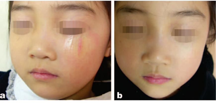
Fig. 3: A 7-year-old girl who injured her face at kindergarten with (a) a scratch and bruising at baseline, and (b) 10 weeks from baseline and 2 weeks after the final treatment session (16 sessions over 8 weeks)