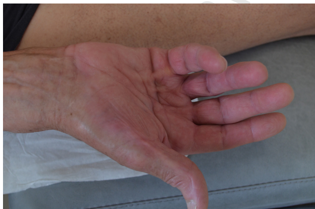
Fig. 1. Visible cords after 6 weeks of treatment.

A 66-year-old male patient was managed for melanoma with unresectable metastatic cervical lymph nodes. Lymph node metastases carried a V600E mutation and vemurafenib was started (Zelboraf®, 960 mg, twice daily orally). After 6 weeks of treatment, the patient noted the rapidly progressive development of fixed digital flexion contractures affecting the metacarpophalangeal joints of the small and ring fingers, with visible cords adhering to the skin (Fig. 1). The impairment was bilateral but asymmetrical. The