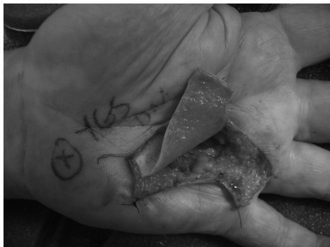
FIGURE 1. Insetting of dermal matrix to the wound bed.

presentation, presence of diabetes or prostate cancer, use of beta-blockers or alcohol, and presence of seizure disorder (Table 1). The distribution of the areas of the hand with Dupuytren's tissue was also similar between the 2 groups (Table 2).