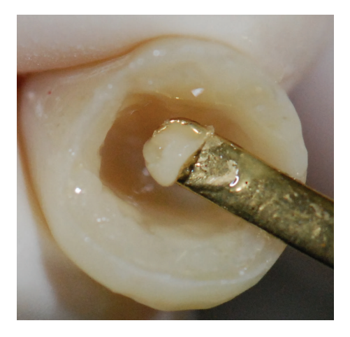
FIGURE 7: A thin layer of composite resin was applied in the inner surface of the resin restoration, for luting.