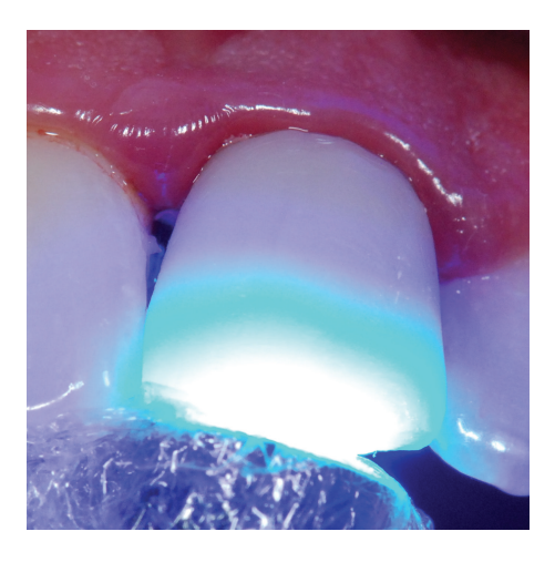
FIGURE 9: Light activation was carried out for the composite resin for 20 seconds, in lingual and buccal faces.