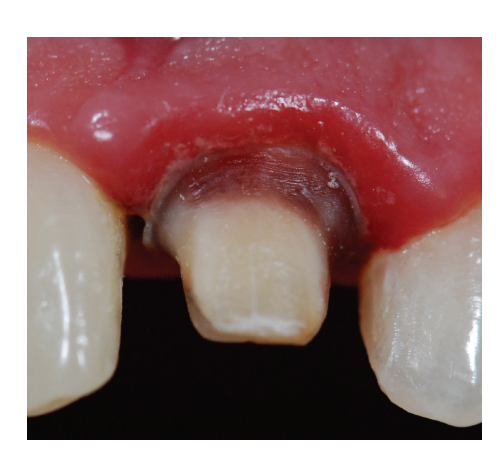
FIGURE 2: Remaining dental structure was evaluated and it was decided to restore it with a composite resin crown.

The first clinical step was to instruct the patient with regard to healthy oral hygiene habits. These instructions were repeated in all clinical sessions throughout the restorative treatment. After this, the veneer was removed and the remaining dental structure was evaluated, showing that, apart from its severe discoloration, this structure was insufficient to support a veneer. Thus the decision was to restore it with a composite resin crown (Figure 2). The tooth was prepared and a provisional acrylic-resin crown (Jet, color 62, Classico, São Paulo, SP, Brazil) was placed (Figure 3).