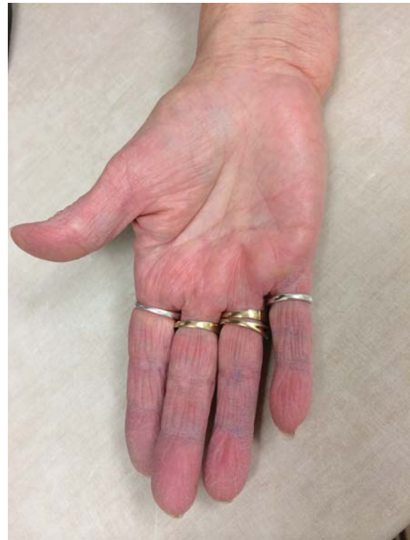
Figure 1. Asymptomatic palmar fibromatosis is noted in this female patient with subtle changes in the palm.

Among the 306 patients with palmar fibromatosis, 8% ( n = 26 ) presented with contracture, while 92% ( n = 280 )