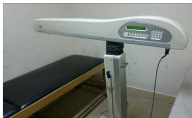
Fig. 1 He Ne laser scanning technique

Descriptive statistics and t test were conducted for comparison of the mean age between both groups. T test was conducted for comparison of treatment mean values of scar thickness,